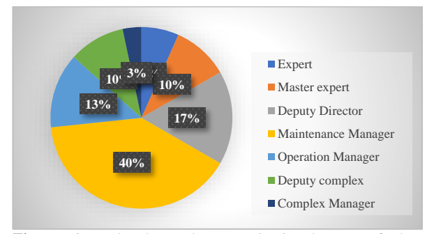
Figure 1. Related to the organizational post of the respondents