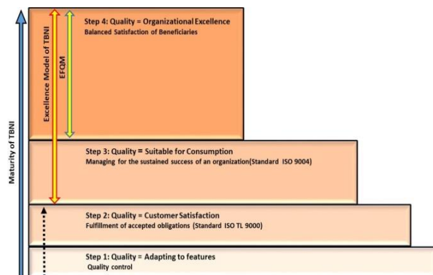
Figure 4. Steps of the maturity of the TBNI

The self-assessment of the TBNI at the company level and 31 provinces of Iran were accomplished by the approach of stimulating the model based on RADAR Logic in 2019, by a team of experts including the university professors in the quality management fields, the ICT technical experts, the consultants specializing in the systematic implementation of the excellence models separating each of the twelve criteria of the model. With regard to the results and the consensus of the evaluation team, the TBNI achieved a score of 667 out of a total of 1000 points as per Table 9.