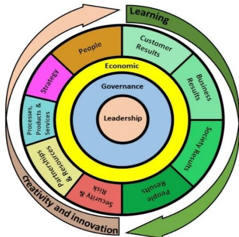
Figure 3. The TBNI Excellence model

The rotational force of the model began with learning from the results, continued with the creativity and innovation of the enablers towards the expected results. This movement along with the appropriate leadership role would never stop.