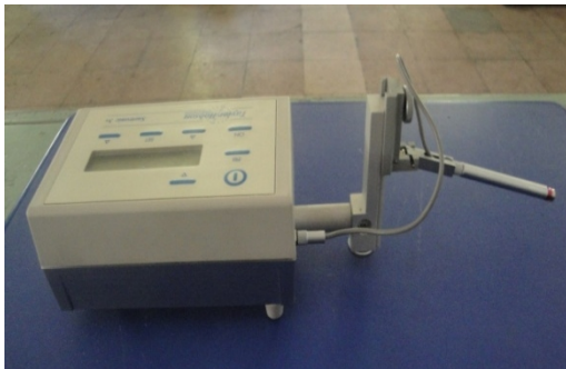
Figure 2. Digital surface roughness tester and electronic balance