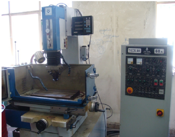
Figure 1. Die-sinking EDM machine used