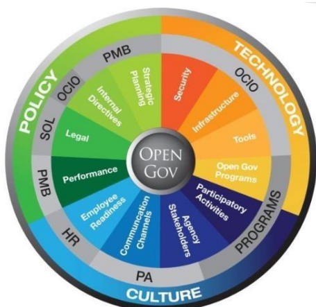
Figure 1. Open government framework of Department of Interior of America country